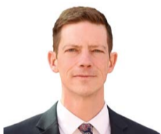
Collin Gallant Comment

It's been a familiar refrain that small business operators are taxed too highly, too highly regulated and in need of relief. Their lobbying leads to "business retention" as an added mandate for municipal economic developers.